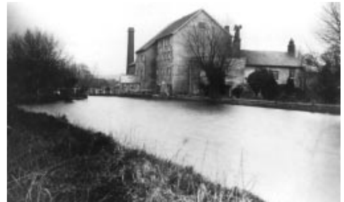
Early photo of the Mill Pond with Westminster Mill House on the right hand side c 1905

The Darent river corridor through South Darent and Horton Kirby supports a wide variety of flora and fauna, but sadly it is not as rich in wildlife as it used to be. If the Darent was named after abundant oak trees, few remain today although new hedge and tree planting schemes are undertaken each year. Hedgerows support a variety of plant species and wildlife and it was good to note that the sloe hedge near the river at the north side of Westminster Field was described in the judge's report from the Men of Trees Competition in 1991, as one of the best he had seen.