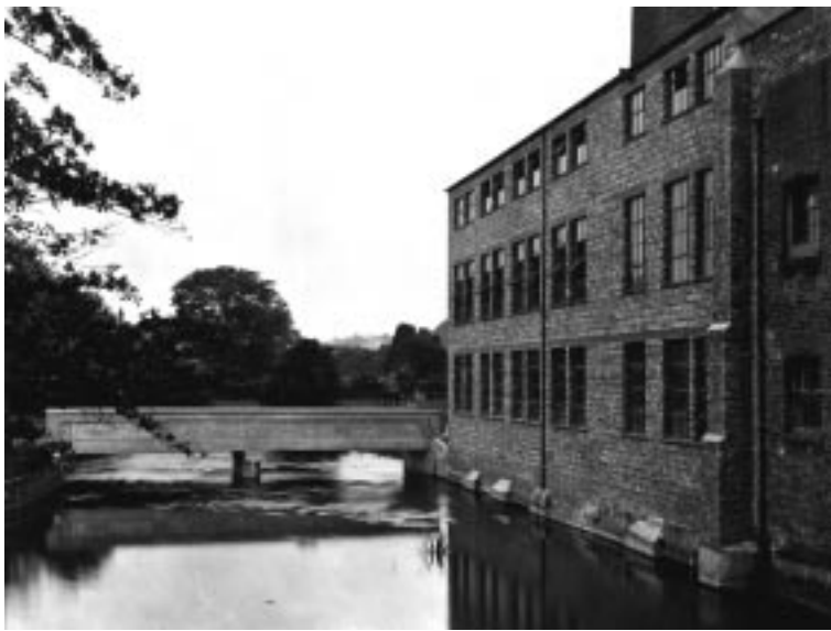
The river in its full glory at Westminster Mill