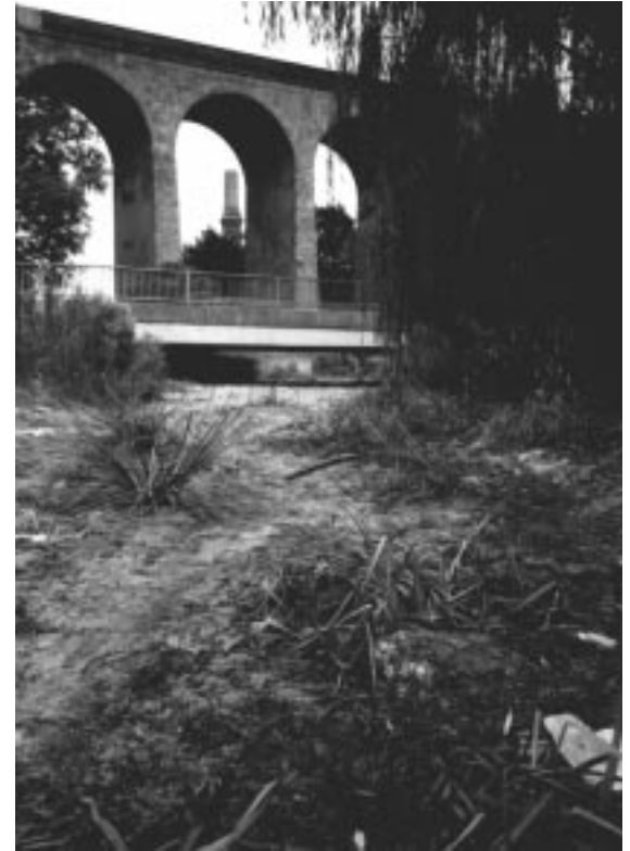
A view of the dry river bed at South Darenth.

As a result of this national interest, in 1993 the National Rivers Authority (NRA) (which since its formation in 1989 has had responsibility for all rivers) put forward a scheme costing around £12m to try and rectify the low flows. Water would be put back into the Darent in a variety of ways including making artificial springs sited along the bank, and pumping water from the Blue Circle lake in Northfleet. In addition, the package includes a number of environmental improvements to enhance the character and natural appearance of the Darent and its banks. The Scheme will be funded jointly by the NRA and Thames Water, each contributing £6m. In January 1994, after lobbying by local activists and politicians, we heard that our scheme was not to be the victim of Department of Environment spending cuts which had been widely feared. The local campaigning and constant pressure on the NRA and government has paid off.