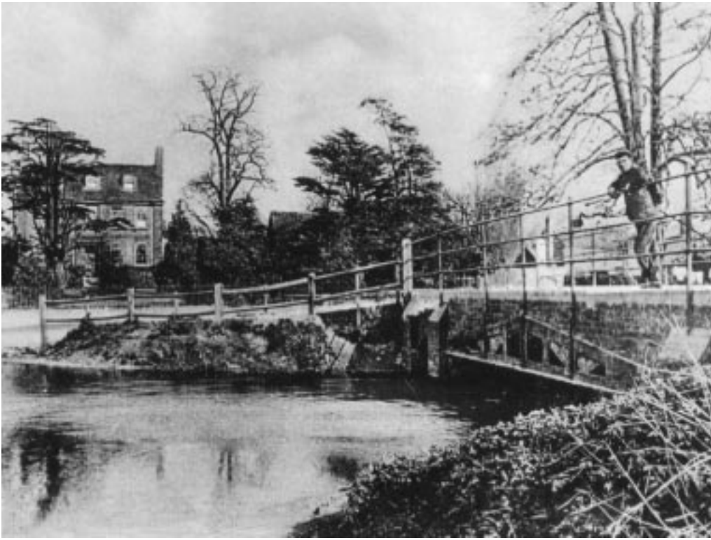
The bridge at Devon Road c 1920. Postcard courtesy of Kent County Library

As a result of this national interest, in 1993 the National Rivers Authority (NRA) (which since its formation in 1989 has had responsibility for all rivers) put forward a scheme costing around £12m to try and rectify the low flows. Water would be put back into the Darent in a variety of ways including making artificial springs sited along the bank, and pumping water from the Blue Circle lake in Northfleet. In addition, the package includes a number of environmental improvements to enhance the character and natural appearance of the Darent and its banks. The Scheme will be funded jointly by the NRA and Thames Water, each contributing £6m. In January 1994, after lobbying by local activists and politicians, we heard that our scheme was not to be the victim of Department of Environment spending cuts which had been widely feared. The local campaigning and constant pressure on the NRA and government has paid off.