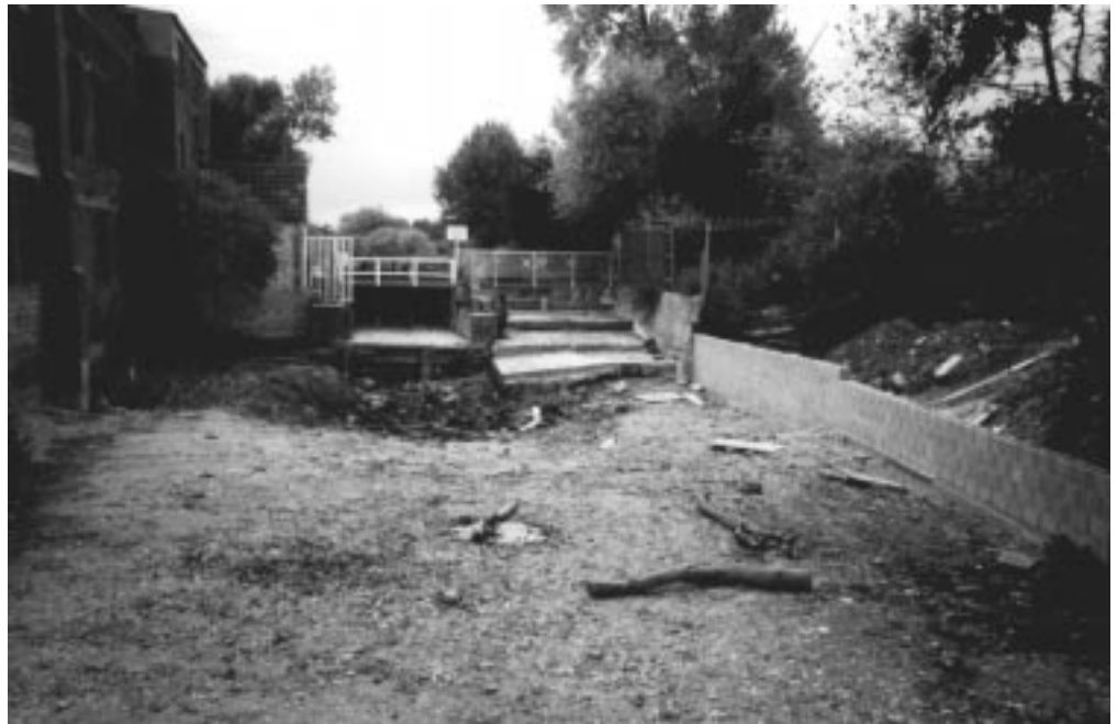
....and without in 1991.