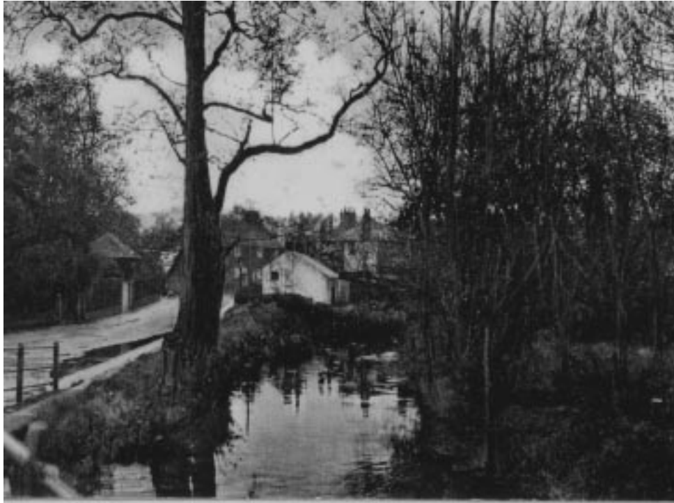
Looking south towards the village from Devon Road bridge. Postcard courtesy of Pete Flewin.

river deteriorated so dramatically that it attracted much attention nationwide. Lord Crickhowell, Chairman of the National Rivers Authority, the national media, our MP Bob Dunn and Minister of State David Trippier, all visited our parish to see the devastation and walk the dried-up riverbed.