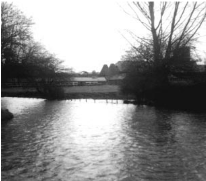
The river in flood flowing past Rogers Farm showing the poultry sheds.

through the river in order to reach the lakes in the Spring. Special warning road signs are provided by the KCC at the appropriate time each year to persuade drivers to slow down not only for the toads' sake but also for that of the Toad Patrol members.