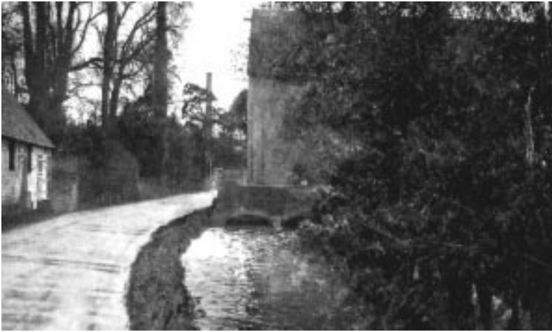
The old Flour Mill South Darenth looking south.