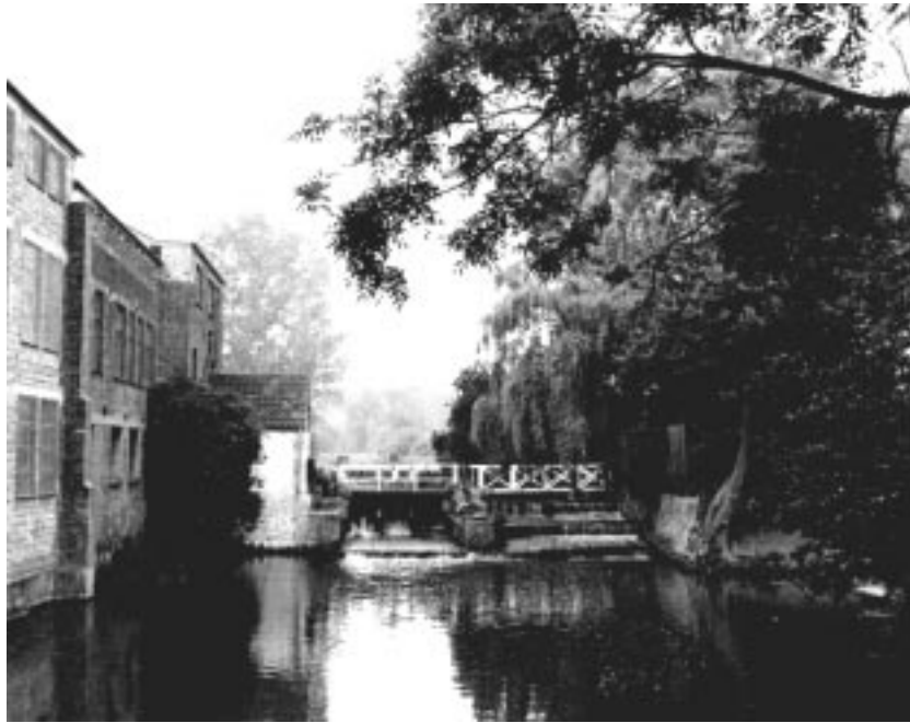
Westminster Weir in the mid Seventies with water.....